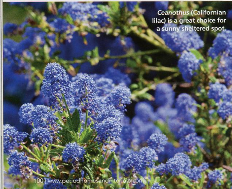
Ceanothus (California lilac) is a great choice for a sunny sheltered spot.

too much,' explains Sue. A bench painted in a soft blue positioned to the side of the pergola makes a lovely vantage point to sit and take in the delightful scene.