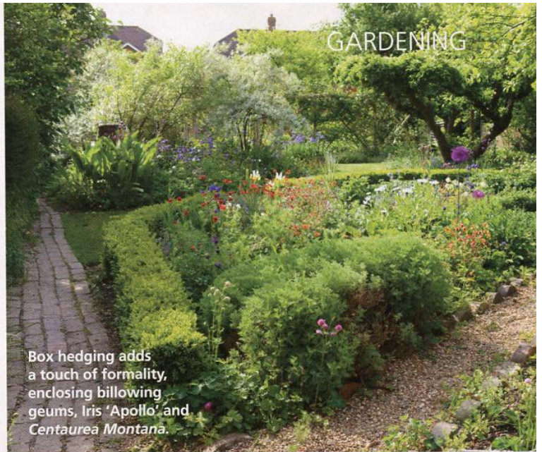
Box hedging adds a touch of formality, enclosing billowing geums, Iris 'Apollo' and Centaurea Montana .