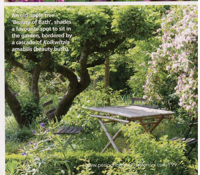
An old apple tree 'Beauty of Bath', shades a favourite spot to sit in the garden, bordered by a cascade of Kolkwitzia amabilis (beauty bush).