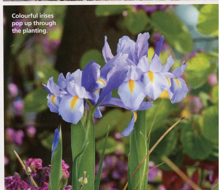
Colourful irises pop up through the planting.