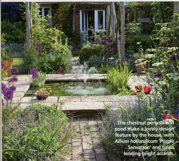
The chestnut pergola and pond make a lovely design feature by the house, with Allium hollandicum 'Purple Sensation' and tulips lending bright accents.