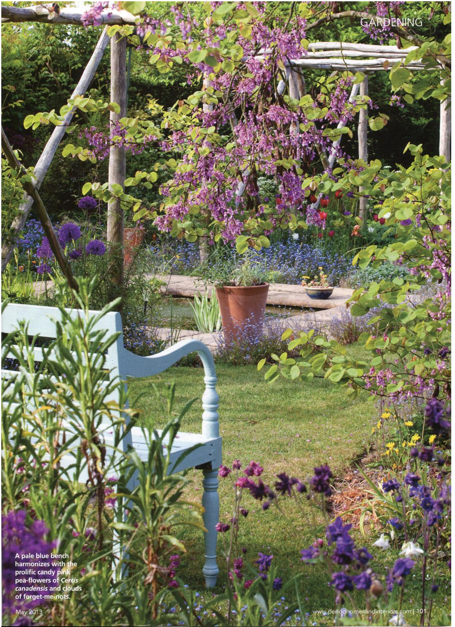
A pale blue bench harmonizes with the prolific candy pink pea-flowers of Cercis canadensis and clouds of forget-me-nots.