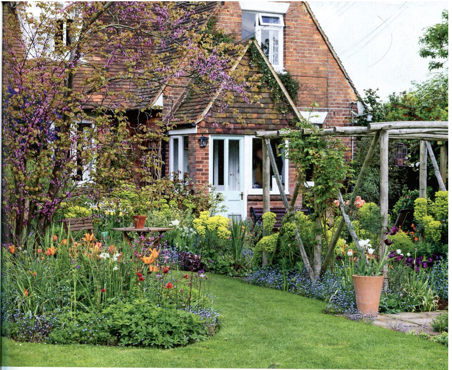
A chestnut pergola frames the view of the garden from the kitchen window. Beneath are clumps of acid-green Euphorbia characias wulfenii . To the left is the eastern rosebud, Cercis Canadensis , presiding over aquilegias, geums and iris 'Apollo', tulips and self-seeded forget-me-nots (above). Below from left: purple tulip 'Curly Sue' with its darker aubergine, claw-edged petals above Euphorbia polychroma ; Dutch iris 'Apollo', with its sunny yellow and pure white display; tulip 'Flamenco', a stunning, fringed tulip with streaks of red. All flower in April.