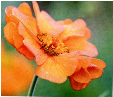
Geum 'Prinses Juliana' is a vivid orange semi-double that will flower from spring into summer.