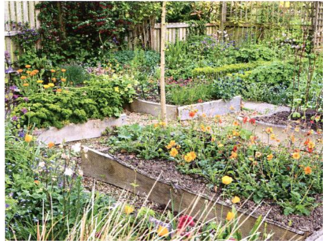
The raised beds in the nursery garden were originally intended for vegetables but two have been taken over by geums.