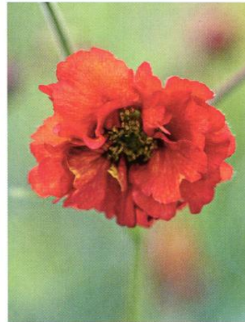
Tomato red geum 'Rubin' takes two to five years to reach its final height of between 6-18in (15-45cm).

polytunnel for the geums and nursery area," she explains.