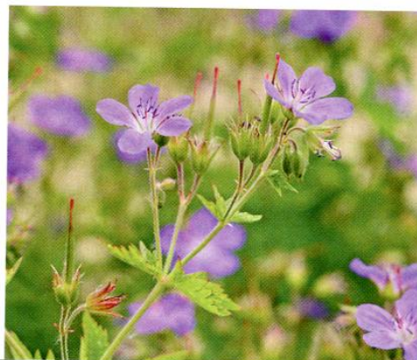
Geranium sylvaticum 'Mayflower' , or wood cranesbill has violet-blue flower heads up to 1in (2.5cm) in width. It reaches 27½in (70cm) in height.

Sue's spring planting relies on a lot of self-seeding plants that add great spontaneity. "But they need controlling," she adds. "I regularly thin out seedlings, otherwise the beds become congested." Among her favourite self-seeders are large spurges with iridescent, acid green-turning-lime-yellow flower