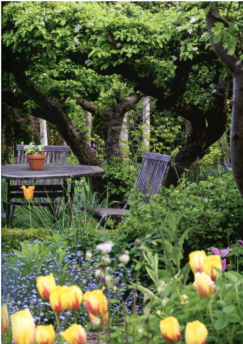
An old apple tree creates a natural canopy over a table and chairs in this tranquil corner. Surrounding it are allium, tulips, geums, euphorbia, centaurea and forget-me-nots. This area sits behind the rope swag.