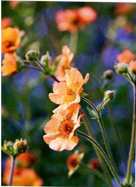
Geum 'Totally Tangerine' , a peachy-orange, long-flowering cultivar, lasts from late spring into early autumn. It reaches a height of 35½in (90cm).